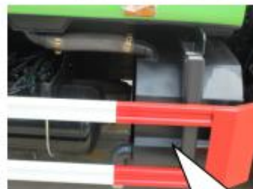
Waste Water collection tank