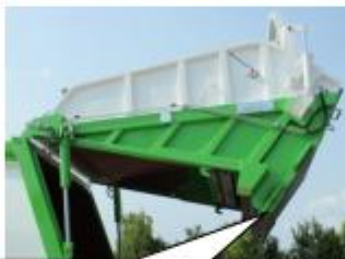
Waste Water Vents (Below the Tailgate)